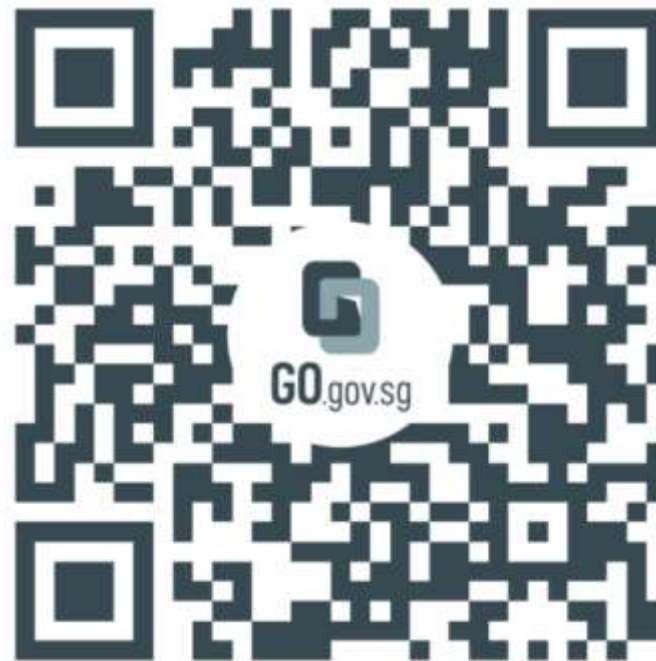
Case Lodgement Form